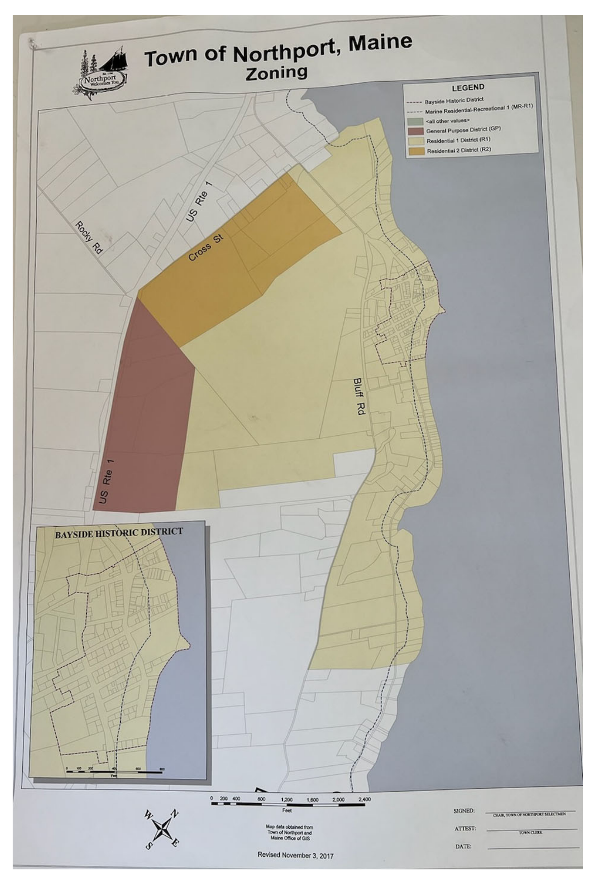
EXHIBIT A Zoning Map of the Northport Village Corporation